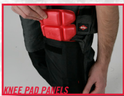
KNEE PAD PANELS